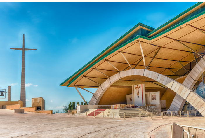
ROTONDO SAN GIOVANNI