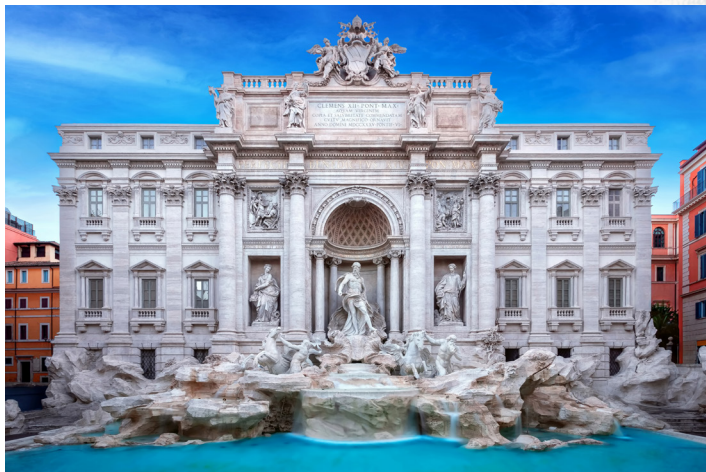
TREVI FOUNTAIN ROME