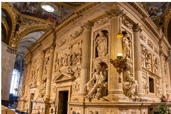
HOLY HOUSE OF LORETO